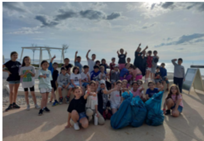
They advance interactive and creative methods of learning, provide students with first-hand learning experiences, reinforce and expand concepts taught in class and enable students to participate in a variety of cross-curricular activities.